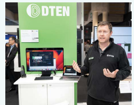
Seen at the DTEN booth - The D7X Dual Screen with a top-mounted camera

DTEN demonstrated the D7X Dual Screen , which stands above the class of earlier dual screens with a top-mounted camera. The D7X comes with a centrally-mounted camera for a more natural, better image placement and clarity, and fore-facing speakers with built-in microphones.