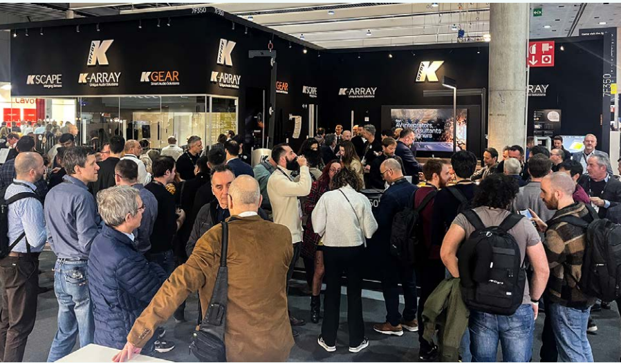
The K-Array booth at ISE 2023 attracts an impressive footfall

K-Array , in their Live Demo booth, showcased their latest innovations, including the redesigned iconic Lizard micro-loudspeaker available in recessed-mounting models too, the updated sound management software, and low-frequency range