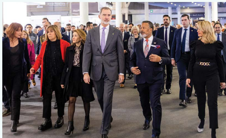
King Felipe VI of Spain graces the floor of ISE Barcelona 2023 with his royal entourage and key national ministers